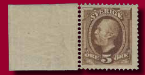
Sold for 106 000 SEK