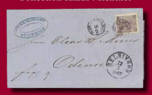
Sold for 72 000 SEK